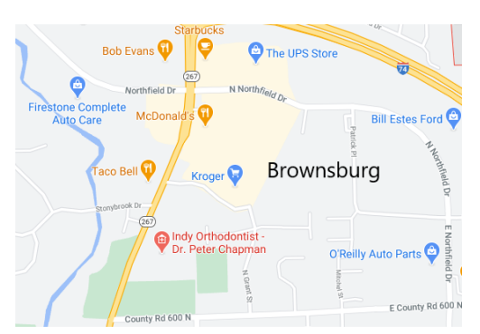
18 Motif Boulevard Brownsburg, IN 46112